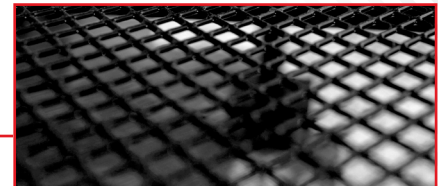
Expanded Steel Side-deck