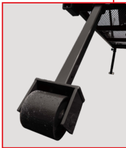
Detachable 6" Ground Rollers