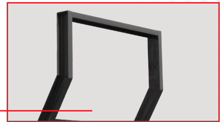
Simple Frame Bulkhead for Maximized Visibility