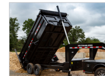
12-TON TELESCOPIC CYLINDER

Our 3 and 4' high side options are great for hauling bulky loads. When using these options with the included rollup tarp kit, you can safely transport loads to and from job sites.