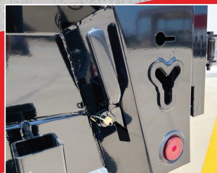
NEW REAR GATE LATCH SYSTEM

AGGRESSIVE NEW BODY DESIGN WITH REINFORCED TOP RAIL