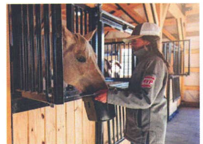
Side Feed Door