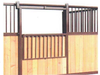
Drop Down Door