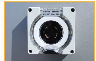
Electrical Kit Base Plug