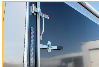
Heavy Duty Cam Latches