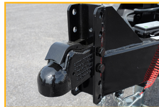
2 5/16" Adjustable Coupler