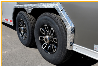
Machined Black Aluminum Wheels