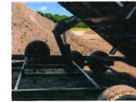
EQUIPMENT LOADING READY

The Scissor-Lift Hydraulic System provides efficient lifting capabilities, a stable lifting platform and power-up, power-down, and gravity down functionality for quick dump cycles.